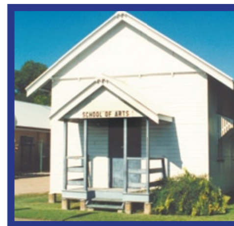
School of Arts, Ayr Burdekin Library