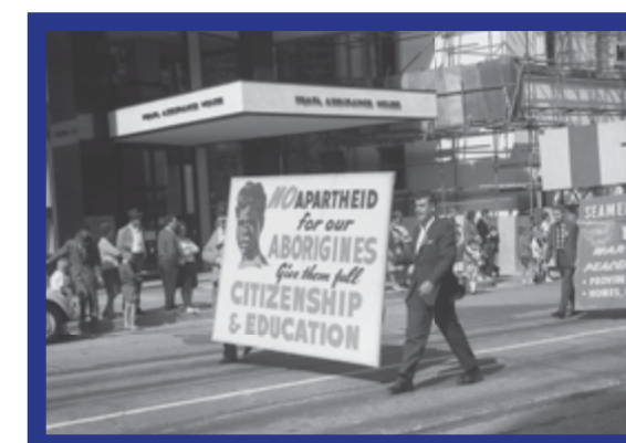
May Day parade, 1966