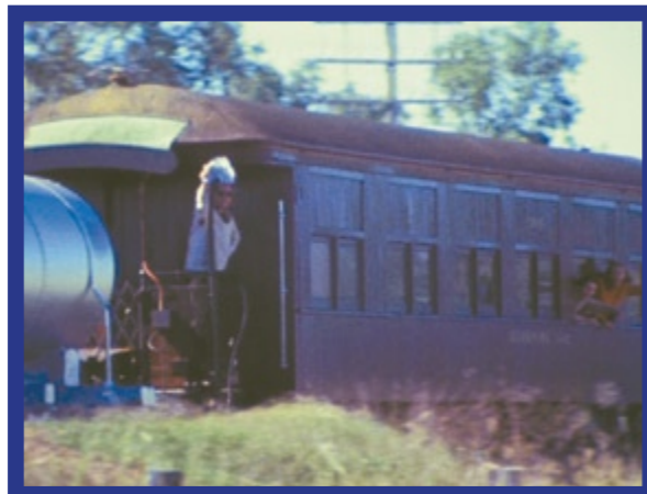
The College Players, Shakespeare on Wheels , 1969