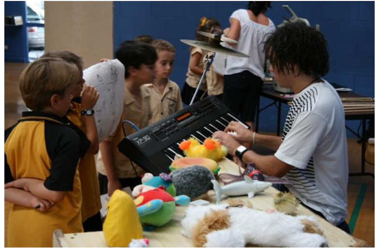
Creating the Soundtrack